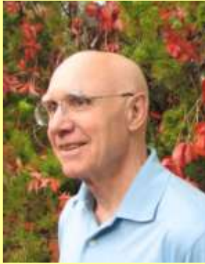
William Wallace University of Nevada-Reno

Two-group experiments are rare; however, statistical tests comparing pairs of group means often follow a multiple-group analysis of variance. The common test statistic for pair-wise contrasts is t or F . (1) A “significant” result indicates that a numerical difference between means is likely not 0 . Constructing a confidence interval (CI) for the difference between the same two means would also indicate the difference is likely not 0, as well as identifying many equally unlikely numerical differences. (2) A “non-significant” t or F merely indicates that a 0 difference between two groups is “possible.” A corresponding CI identifies many possible numerical differences in addition to 0. Thus, constructing CIs for pair-wise comparisons is more informative and more instructive compared to t and F ; and computational procedures are reasonable for inclusion in beginning statistics textbooks.