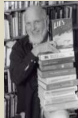
James (Jim) W. Loewen

James Loewen's gripping retelling of American history as it should, and could, be taught, Lies My Teacher Told Me , has sold more than 1,250,000 copies and continues to inspire K-16 teachers to get students to challenge, rather than memorize, their textbooks.