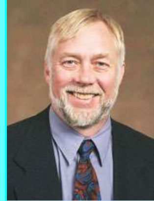
Roy Baumeister Florida State University

Roy F. Baumeister holds the Eppes Eminent Professorship in Psychology at Florida State University, where he is the head of the social psychology graduate program and teaches social psychology to students at all levels. He has taught introductory social psychology to thousands of undergraduate students. He received his Ph.D. from Princeton in 1978, and his teaching and research activities have included appointments at the University of California at Berkeley, Case Western Reserve University, the University of Texas at Austin, the University of Virginia, the Max Planck Institute in Munich (Germany), and the Center for Advanced Study in the Behavioral Sciences at Stanford. Baumeister is an active researcher whose work has been funded by the National Institute of Mental Health and by the Templeton Foundation. He has done research on the self (including self-esteem and self-control), the need to belong, sexuality, aggression, and how people find meaning in life. In 2005, the Institute for Scientific Information concluded from a survey of published bibliographies that he was among the most influential psychologists in the world. His publications have been cited over 5,000 times. Baumeister lives with his wife and daughter by a small lake in Tallahassee, Florida. In his (very rare) spare time, he likes to play guitar and piano or go windsurfing.